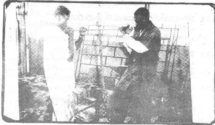
Engineering students in a practical foundry engineering demonstration