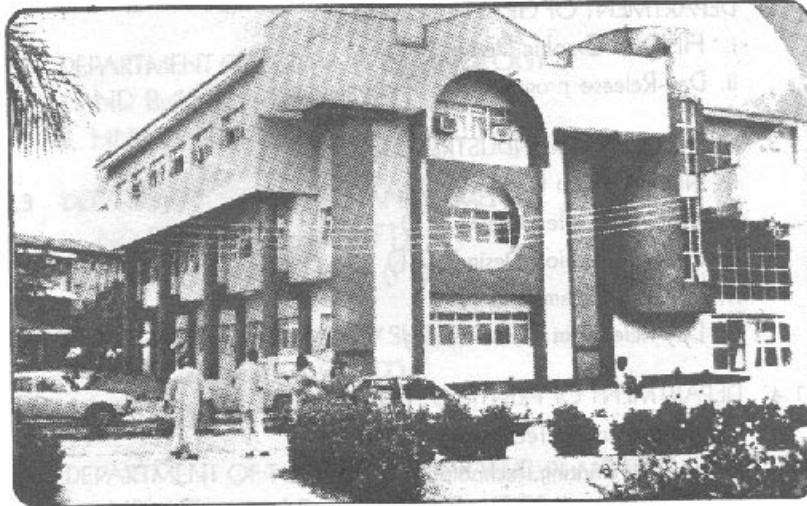
The newly commissioned School of Environmental Studies Building

Whereas most of these programmes are available at both the National Diploma (ND) and the Higher National Diploma (HND) levels, some are available at