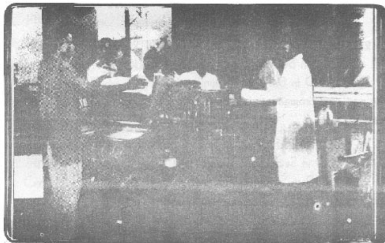
Students of Printing Department: in a practical class